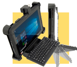
Vehicle Mount plus rugged keyboard